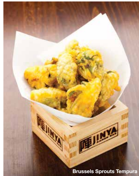
Brussels Sprouts Tempura