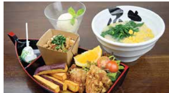
Kids' Meal 7. 00 chicken ramen w/ spinach and corn, chashu rice, crispy chicken, sweet potato fries, orange, candy, and vanilla ice cream