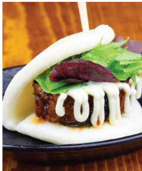
JINYA Bun (1 pc.) 3. 95 steamed bun stuffed with slow-braised pork chashu, cucumber, and baby mixed greens served with JINYA's original bun sauce and kewpie mayonnaise