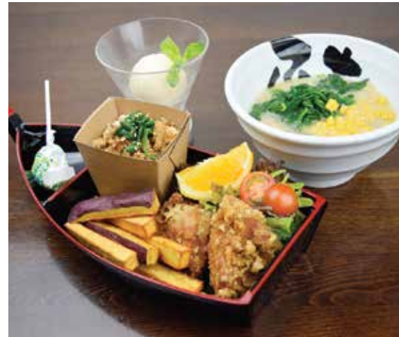
Kids' Meal 7. 95 chicken ramen w/ spinach and corn, chashu rice, crispy chicken, sweet potato fries, orange, candy, and vanilla ice cream