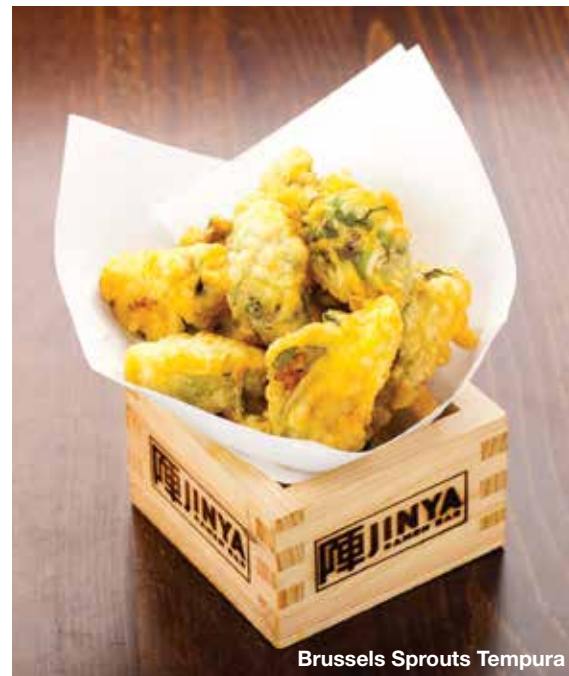
Brussels Sprouts Tempura