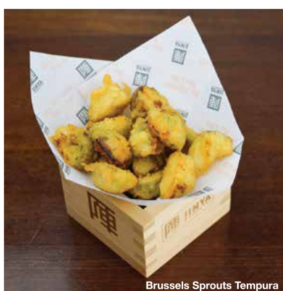
Brussels Sprouts Tempura