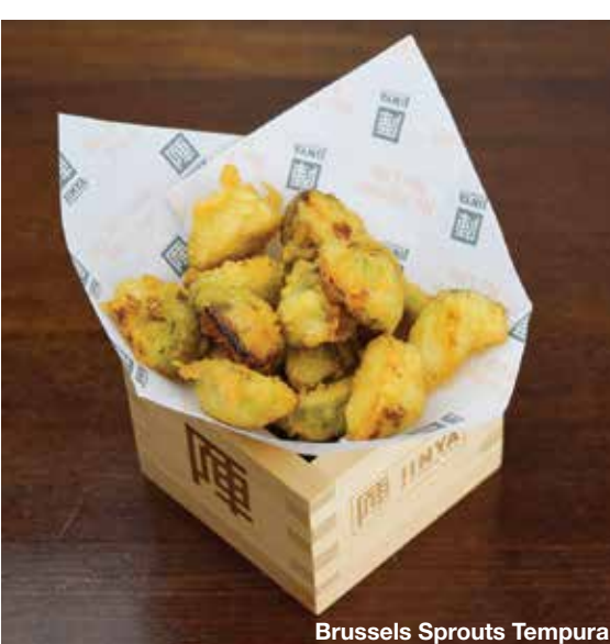
Brussels Sprouts Tempura