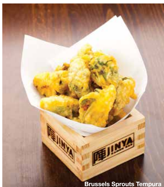
Brussels Sprouts Tempura