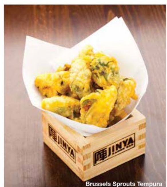
Brussels Sprouts Tempura